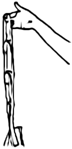
Loop style Attachment

Wy'East Medical lift slings are fully compatible with other manufacturers' floor and ceiling lift systems using hook style sling bars. Lifting slings may be used with 2 or 4 point hook style sling bars. Repositioning slings may be used with multiple point hook style sling bars suitable for the size of sling being used. Wy'East Medical floor lifts are fully compatible with other manufacturers' slings utilizing the sling loop attachment method of attaching slings to floor lifts and ceiling lifts. The care provider must follow the responsible vendor's instruction manuals and recommendations with respect to the use, care, cleaning and inspection of slings and patient lifts.